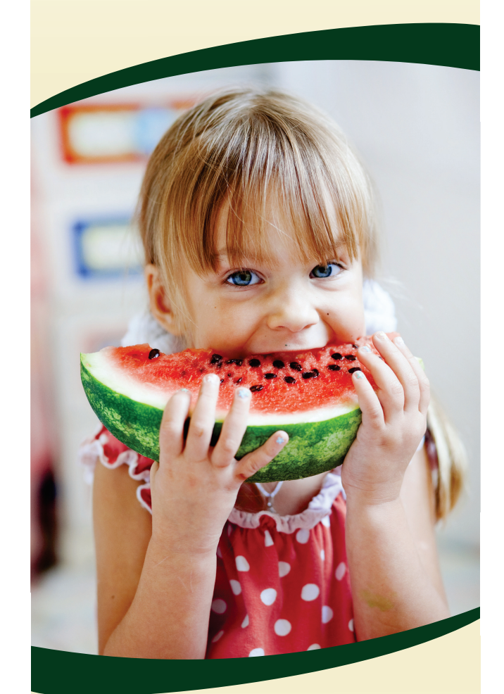
Your partner in Food Safety certification